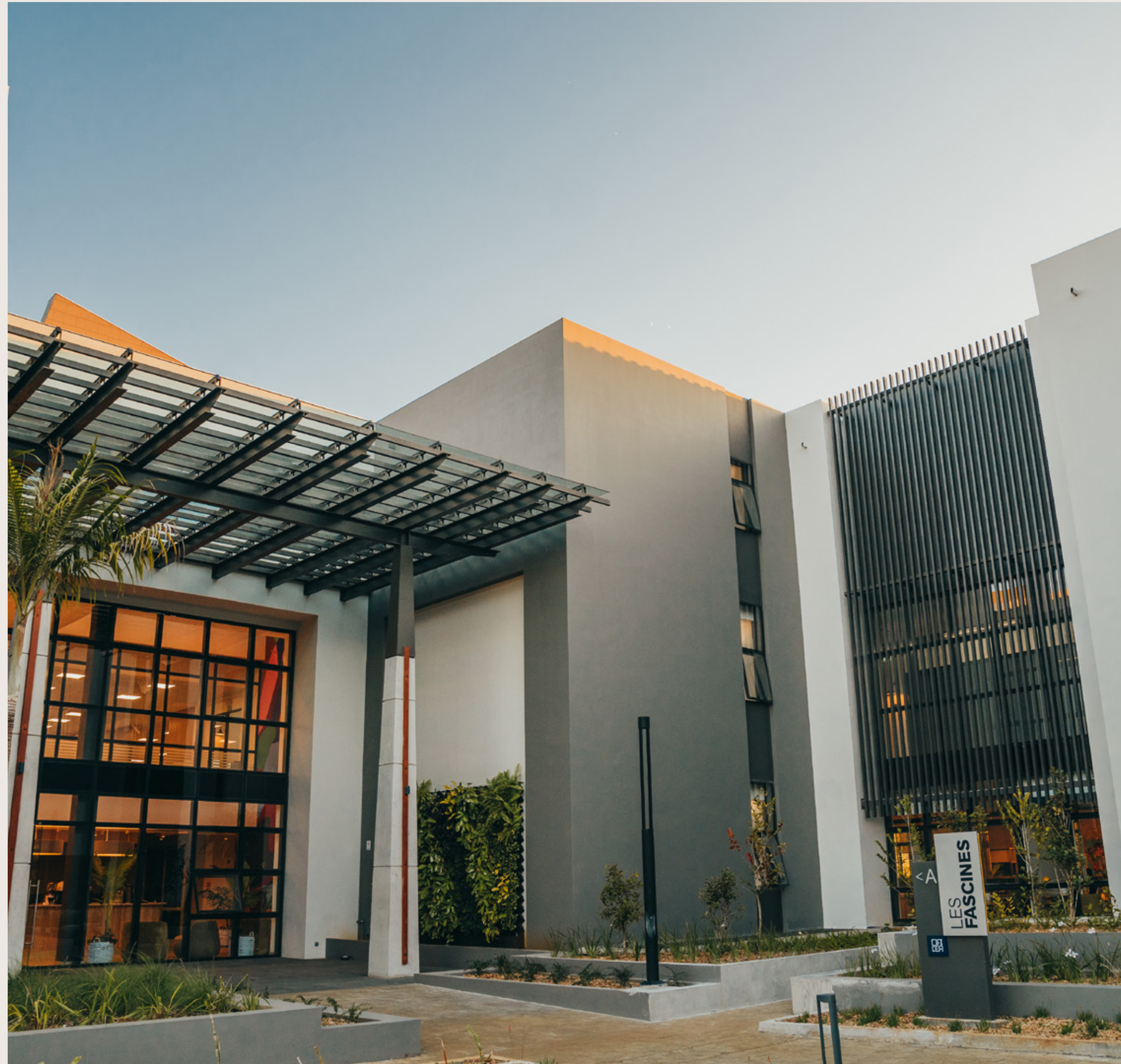
Workshop17 at Vivéa, Moka