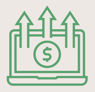
A business conducive environment